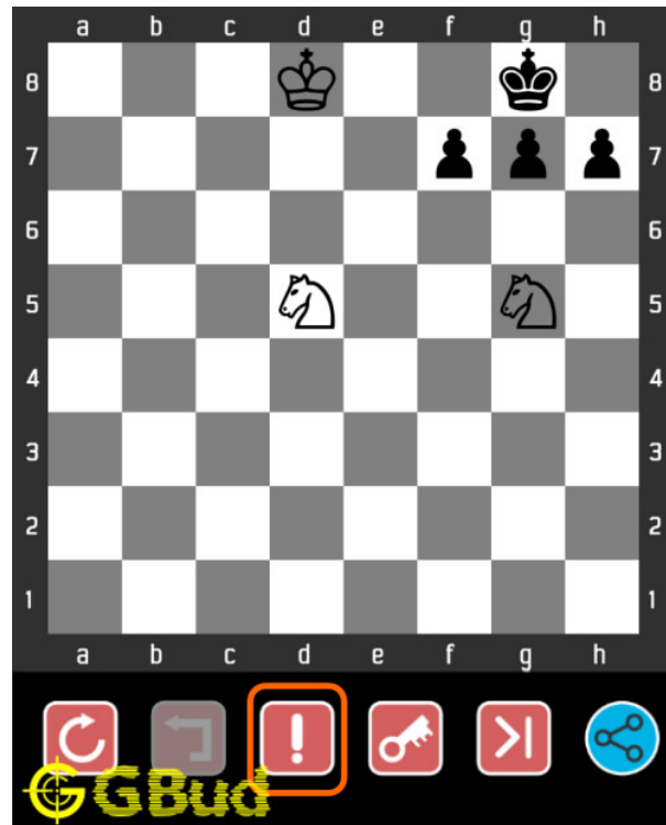
Figure 1.4: Click the help button to get help on next move @ https://gbud.in/g6lg9p3